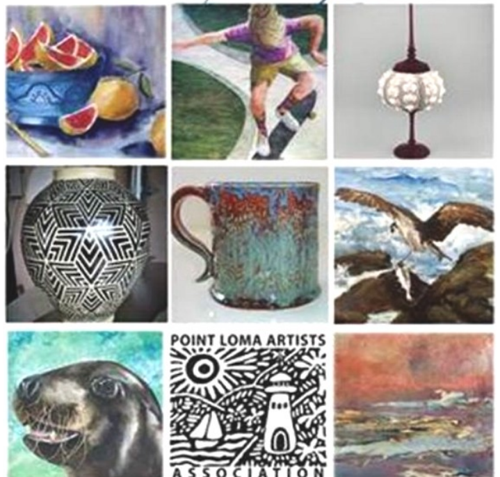
EXHIBIT DATES APRIL 5 ~ JUNE 28

POINT LOMA ARTISTS ASSOCIATION 2024 Exhibit RECEPTION Saturday, April 13 • 1 - 3 pm Point Loma/Hervey Library Music by Bob Giesick