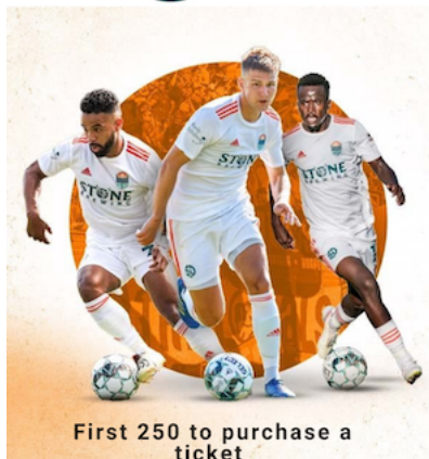
First 250 to purchase a ticket will receive a commemorative scarf