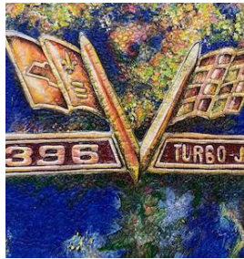
Image: 396 Turbo Jet