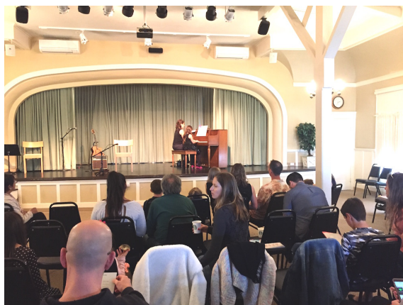
Junior students take the stage to warm up before Paper Moon's Guitar Recital on January 7.

A great way to start the day is with this Fundraiser to benefit underfunded programs at the Monument. Register at active.com/san-diego-ca/running/distance-running-races/cabrillo-sunrise-5k-fun-run-and-walk-2018 .