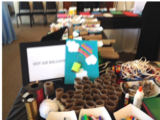
All the art pieces were created out of recycled materials such as candy and gum wrappers, bottle caps, etc.